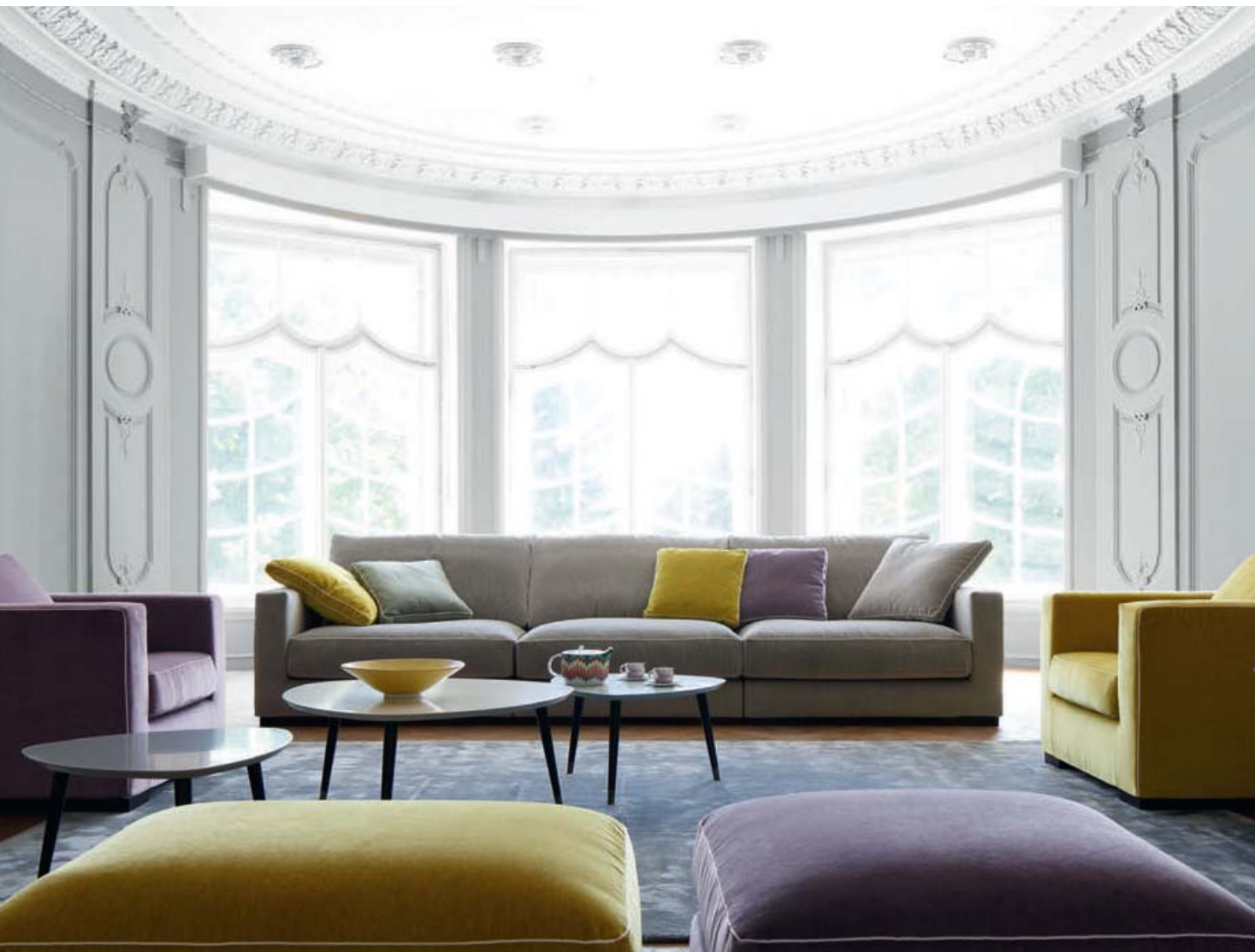
Long Island 2 modular sofa, designed by Studio Roche Bobois

Metal floor lamp with a brushed brass or nickel finish and hand-blown glass. LED lighting or compact fluorescent lightbulb. Ø22 x H.157cm