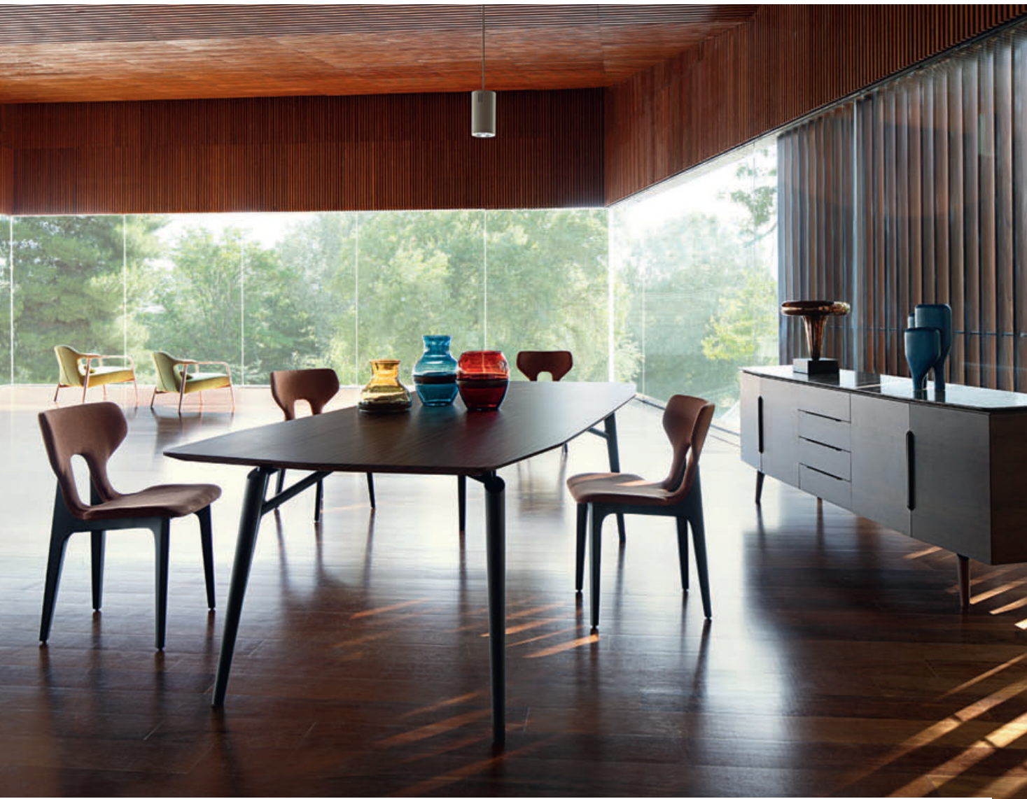
Lieto dining table, designed by Roberto Tapinassi and Maurizio Manzoni

Matte black metal stands with aluminium coated shades (copper, black, grey, coral and white options). H.120/170cm