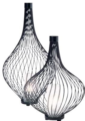
Panier floor lamps, designed by Pierre Dubois and Aimé Cécil

L.231 x H.70/105 x D.116/169cm. Corrected grain pigmented Tendresse leather. New remote control-operated electronic multi-position recliner mechanism with full extension option. High density foam-filled memory seat cushions, lumbar cushions and backrests. Solid wood, particleboard and plywood frame with elastic webbing suspension. Chromed metal feet. Available in different dimensions. Optional scatter cushions. Maillon rug designed by Lili Gayman. Aqua end tables designed by Fabrice Berrux. European manufacture.