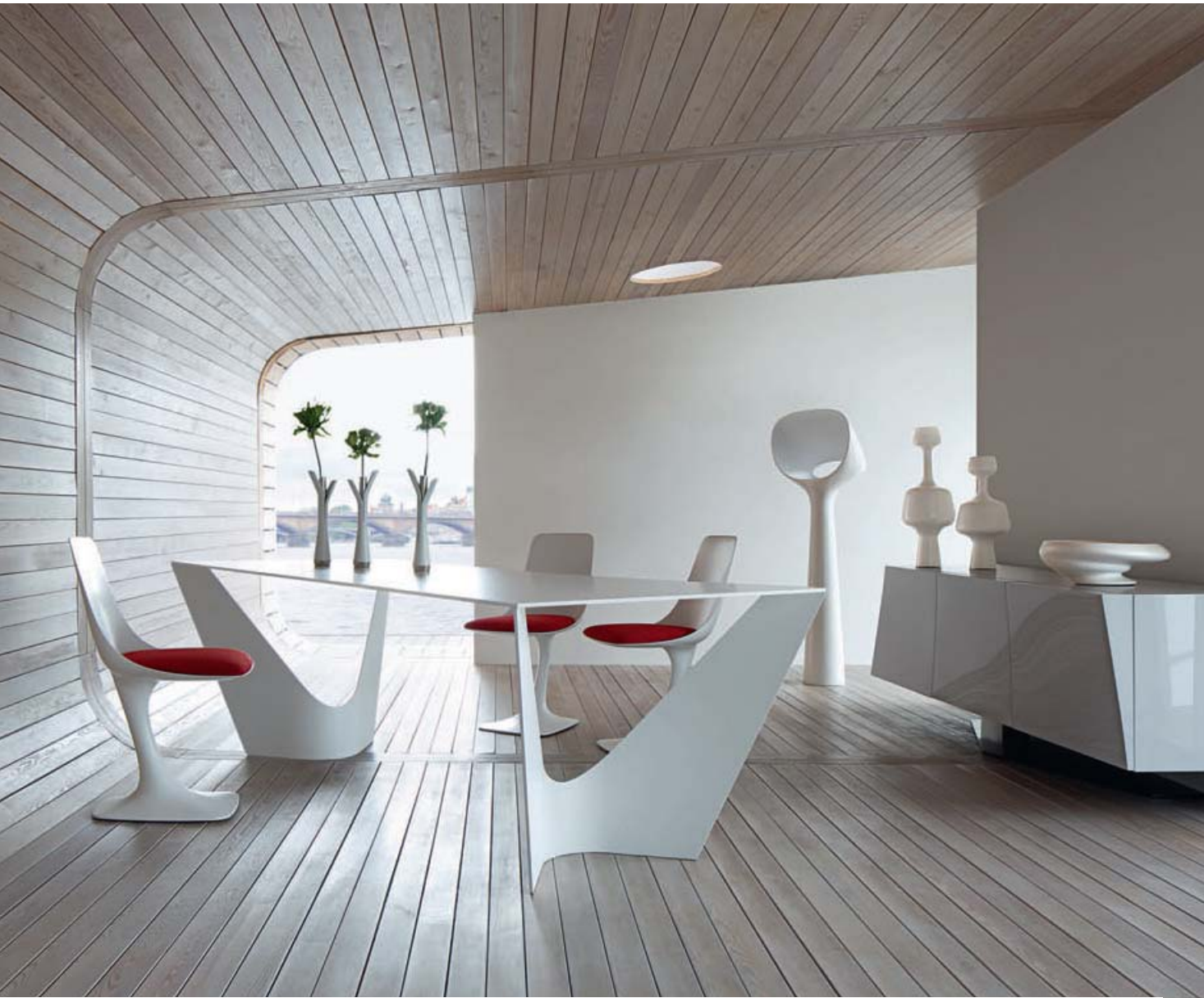
Suspens dining table, designed by Cédric Ragot

White lacquered steel arches with 12mm glass top. L.102 x H.33cm European manufacture.