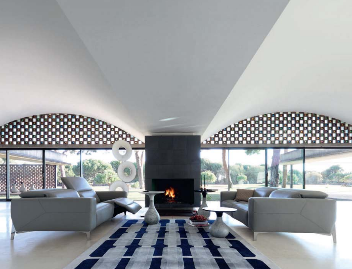
Pluriel 3-seat leather sofa, designed by Roberto Tapinassi & Maurizio Manzoni

L.231 x H.70/105 x D.116/169cm. Corrected grain pigmented Tendresse leather. New remote control-operated electronic multi-position recliner mechanism with full extension option. High density foam-filled memory seat cushions, lumbar cushions and backrests. Solid wood, particleboard and plywood frame with elastic webbing suspension. Chromed metal feet. Available in different dimensions. Optional scatter cushions. Maillon rug designed by Lili Gayman. Aqua end tables designed by Fabrice Berrux. European manufacture.