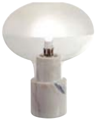
Marble lamp, designed by Aimé Cécil and Pierre Dubois

Lamp with white marble base and hand-blown glass lampshade. H.56cm