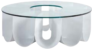
Iride cocktail table, designed by Alessandro Busana

White lacquered steel arches with 12mm glass top. L.102 x H.33cm European manufacture.