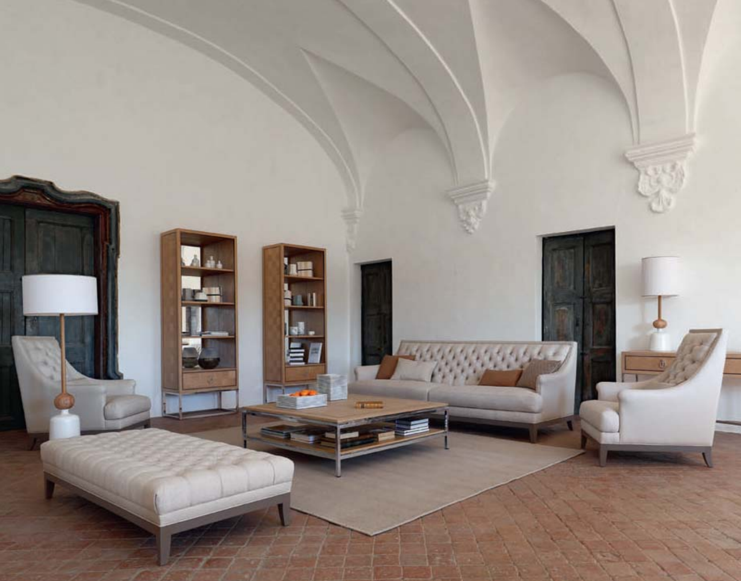
Epoq 3-seat sofa, designed by Pierre Dubois and Aimé Cécil

L.220 x H.84 x D.95cm. Corrected grain Tango calfskin leather and Saville linen. Feather and terylene quilt filling on high density foam. Leather buttoned backrest. Solid wood, plywood and particleboard structure with elastic webbing suspension. Taupe-tinted solid wood base. Available in different dimensions and as armchair and ottoman. Optional scatter cushions. Epoq sideboard designed by Pierre Dubois and Aimé Cécil. European manufacture.