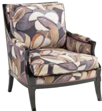
Léa bergère armchair, designed by Studio Roche Bobois

L.220 x H.84 x D.95cm. Corrected grain Tango calfskin leather and Saville linen. Feather and terylene quilt filling on high density foam. Leather buttoned backrest. Solid wood, plywood and particleboard structure with elastic webbing suspension. Taupe-tinted solid wood base. Available in different dimensions and as armchair and ottoman. Optional scatter cushions. Epoq sideboard designed by Pierre Dubois and Aimé Cécil. European manufacture.