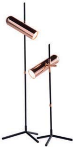
Wander floor and reading lamps, designed by Cristian Mohaded

Matte black metal stands with aluminium coated shades (copper, black, grey, coral and white options). H.120/170cm