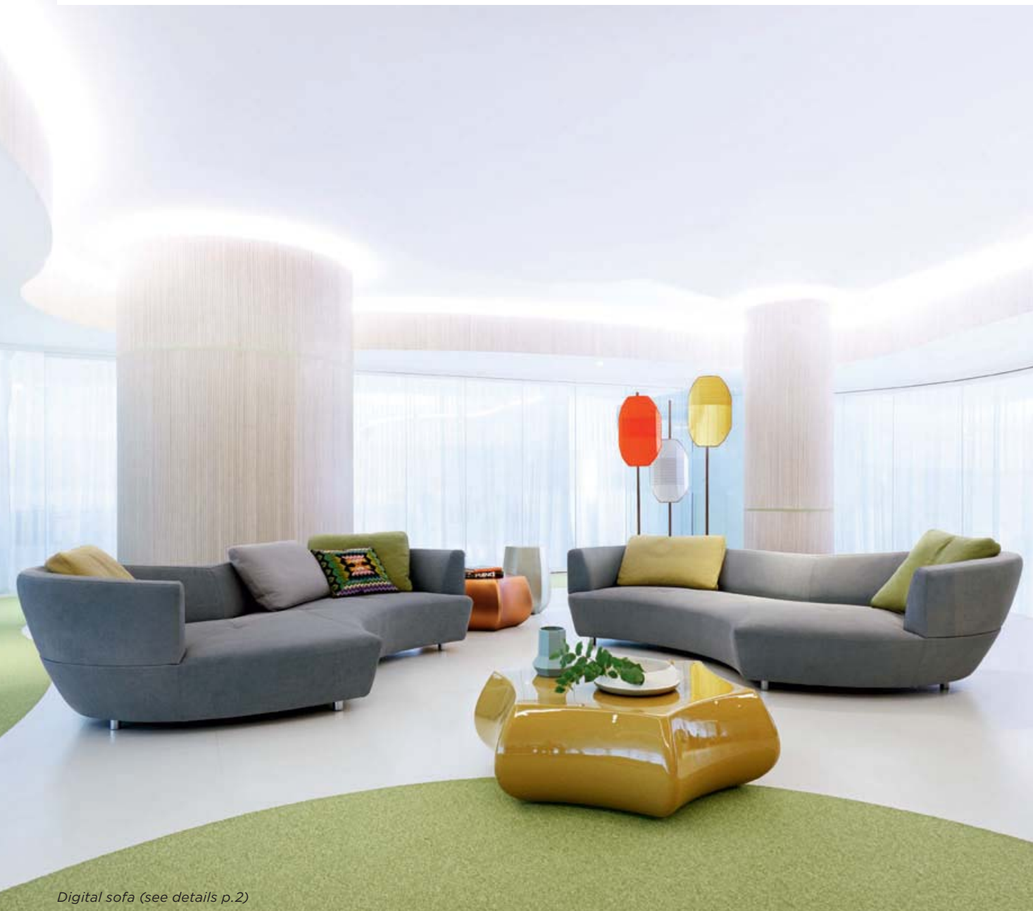
Digital sofa (see details p.2)