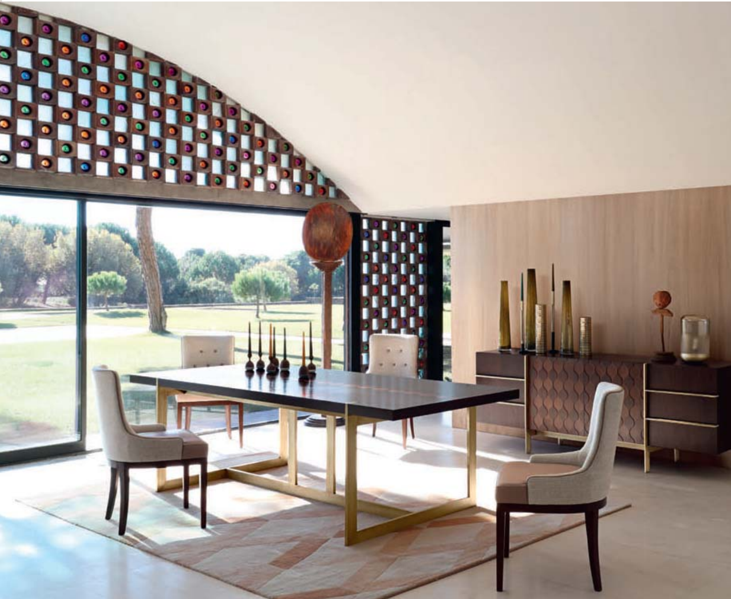
Trocadero dining furniture, designed by Pierre Dubois and Aimé Cécil

Lamp with white marble base and hand-blown glass lampshade. H.56cm